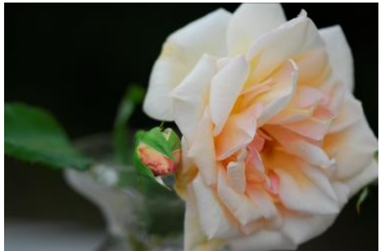
Left: Rosenlund garden in Jönköping, Right: 'Prince de Bulgarie' favorite rose of Crown Princess Margaret