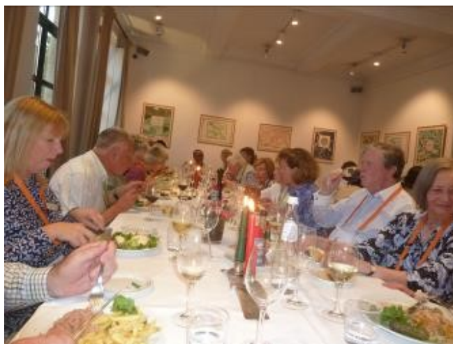
Left: Friends Dinner at Au Vieux St Martin Restaurant, Brussels, Belgium