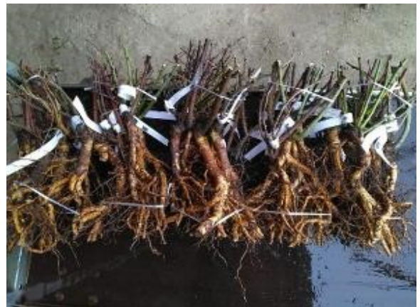
Left: Overhead view of Rosedal El Carmen, Right: Rose bushes ready to be sent from France to Argentina