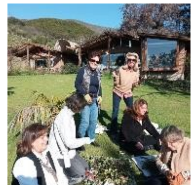
Above: Rosaleda del Parque Araucano, From left: Ladies in their rose aprons, pruning in the park, preparing cuttings for propagation