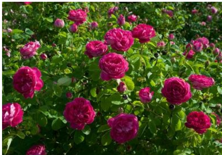
Left: Carl Larsson, who became famous for his paintings from his own artist's home, almost never painted a picture without a flower. This portrait of a rose has later been identified as the hybrid tea 'Mme. Caroline Testout'. Right: 'Pipar Hans'