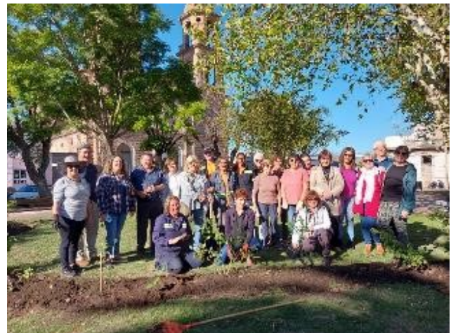
Above: Dolores authorities, members of AUR Oeste Branch and locals planting 'Rosa de la Plaza de Dolores'