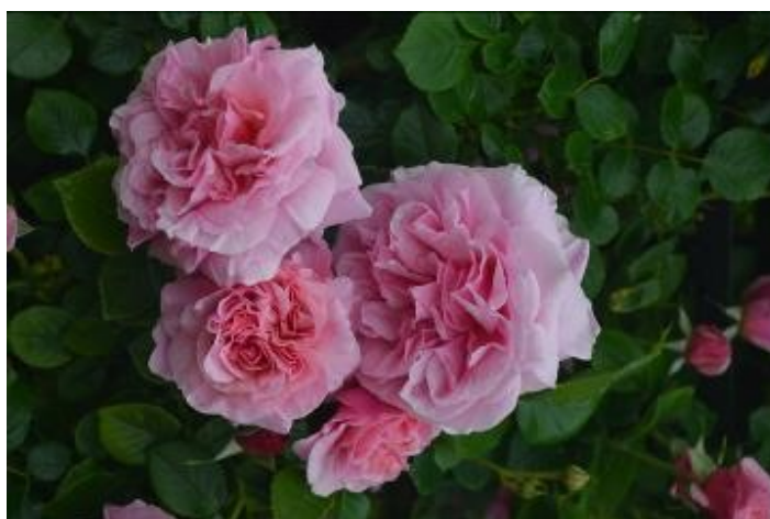
Above: 'Gertrude Jekyll' in the authors garden

During the balmy days of summer, my garden at Bennett's Court, is enriched by the divine fragrance emitted from the fine English rose, 'Gertrude Jekyll', which wafts into the air giving endless joy and contentment to my day.