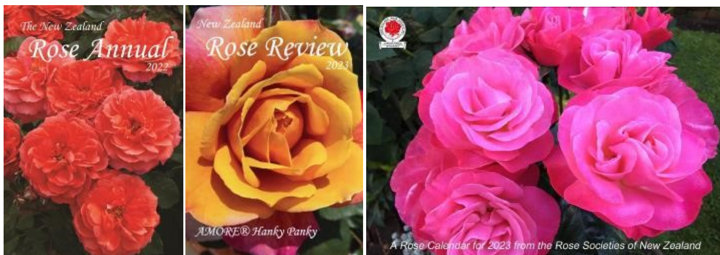
New Zealand publications: Left: 2022 Annual, Middle 2023 Rose Review, and Right: 2023 Calendar