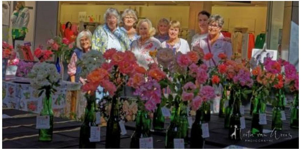
Knysna Rose Show, Left: Queen 'Deloitte and Touche', Right: Rose Show & members Knysna Rose Society

Ludwig's Roses named a rose in honour of 'Pretty Yende' – born in the small town of Piet Retief, this South African soprano has risen to the top of the opera world. She was recently invited to perform at the coronation of the King Charles III.