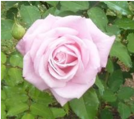
'Belinda's Dream' (1992, S)