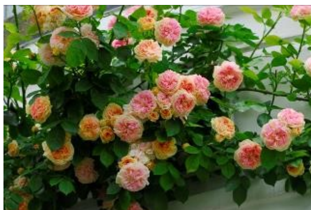
Left: 'Cl. American Beauty', Right: 'Alchymist'