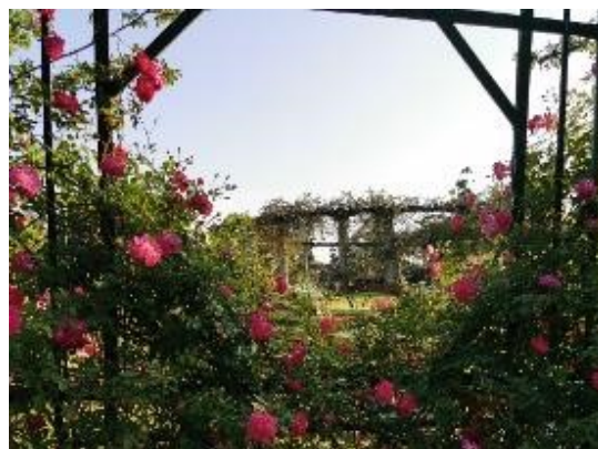
Above: Montevideo Rose Garden: roundabout seen through the pergola

I have been an honorary and volunteer advisor to the Montevideo Municipality from 2016 to 2021 concerning this public Rose Garden, the first “roseraie” in South America, inaugurated in November 1912. Identification of rose varieties has been possible in many cases but the needed restauration of missing rose bushes has not yet been done because of delay in government decisions, lack of the needed resources as well as inactivity due to the COVID pandemic. In June 2023 I gave a lecture at the Brussels Heritage Rose Convention about the problems of this rose garden as well as its importance as a historic monument which was designed by relevant XIXth Century landscape architects and which included nearly 1.000 rose varieties in 1917-1919. The AUR and myself, as the Heritage & Conservation Committee delegate for Uruguay, shall insist on this issue in the coming months, after having noticed that some works have begun but without taking into consideration esthetical aspects.