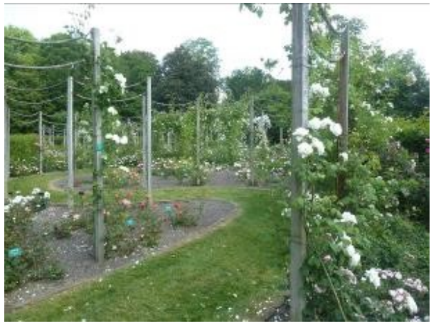
Left: Coloma Castle, Right: United States breeders garden

could have spent all day there. The gardens have grown in size since my last visit a decade ago and feature special areas of roses from different countries' breeders. There are about 60000 roses here of about 3000 varieties. There are several rose beds that feature Belgian hybridizers such as Delforge and Louis Lens. The roses that grew among the fruit and nut trees have long since vanished, although a few remain.