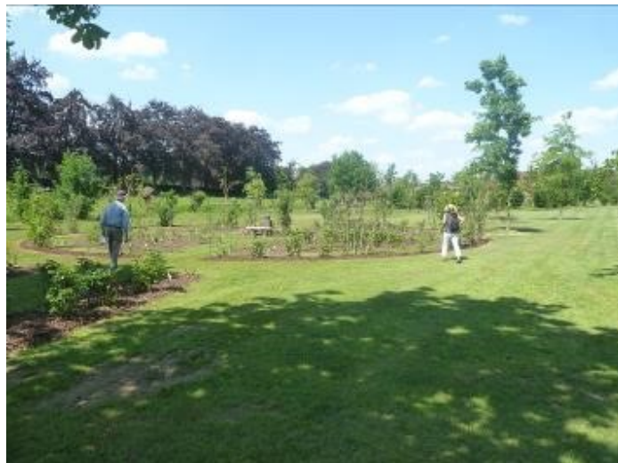
Above: Widooie Castle and gardens

compared to most of the formal rose gardens of Europe. There are about 1400 roses and 500 varieties here, largely old garden roses and ramblers. It is said that the China roses on the property are among the earliest known specimens in Europe. Owner Ghislain Count d'Ursel lead the tour of the gardens.