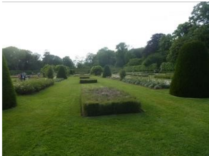
Left: Meise Species Garden, Right: Vrijbroek Rose Garden

were not allowed in the collection area. Back in the day they used mercury to preserve the samples so special precautions need to be taken to gain entry. However, they do have an impressive collection of about 120 species roses in their rose garden. Vrijbroek was Awarded the WFRS Award of Garden Excellence in 2003. Here we had a fabulous dinner along with music. The rose garden has about 10000 roses of about 800 varieties covering 1.5 ha.