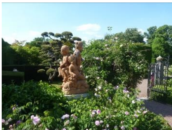
Above left: Ghislain Count d'Ursel greeting the tour group, Right: One of many gardens in Hex Castle

The World Convention in Japan will be 18-24 May, 2025 and consist of three different pre tours and three post tours covering different parts of the country. The pre tours will be 12-17 May and post tours 25-30 May. The pre tours include visits throughout the