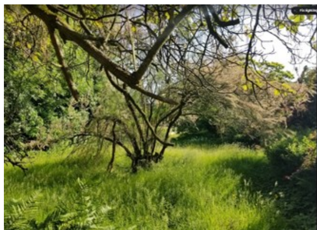
Top: Oostkerke Castle & Gardens, Above: House Beaucarne & Gardens

We returned to Ghent and visited St. Blaas. What made this unique is the center portion of the altarpiece of the Mystic Lamb shared many typical plant materials and flowers of the medieval period. Besides being a stunning piece of artwork it was the accuracy of the plant material that fascinated me.