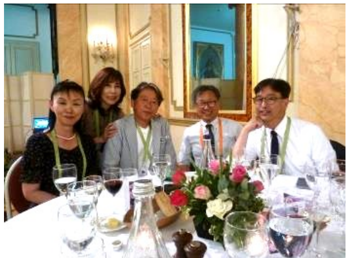
Attendees enjoying the Gala Dinner