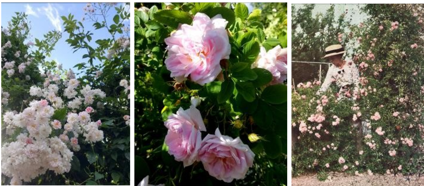
From left: 'Paul's Himalayan Musk' against the blue sky at Rosenlund in Jönköping, Rosa alba 'Minette' which is still growing in the garden of Karin and Carl Larsson, Crown Princess Margareta in one of her rose borders at Sofiero in Helsingborg.

A person who had a great impact when it came to both garden fashion and interior design ideals at this time was Karin Larsson, wife of the famous artist Carl-Larsson. In the couple's garden in Dalarna in northern Sweden, Karin grew Alba roses around 1890, but she also challenged the cold climate by trying the latest hybrid teas from France. She and Carl had lived in France for some years, and they were influenced by French gardening and of course by French cuisine. In her kitchen garden Karin grew spinach, tomatoes, asparagus and artichokes. In her flowerbeds she tried 'Mme Caroline Testout' and also the latest scented paeony, 'Sara Bernhardt' amongst lots of Swedish wildflowers.