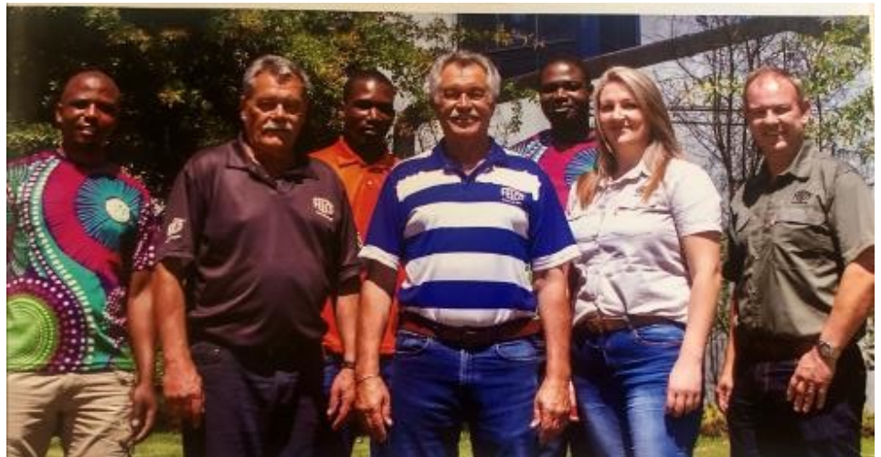
Left: Poster for the National Convention, Right: FELCO team South Africa