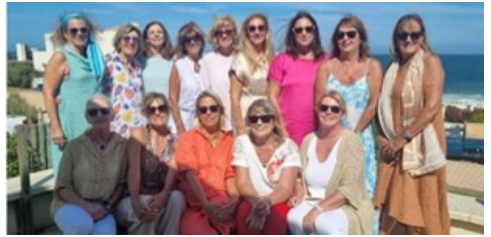
Left: AUR members at San Pedro Rose Garden, Manantiales, Uruguay, Right: Members of the AUR Board