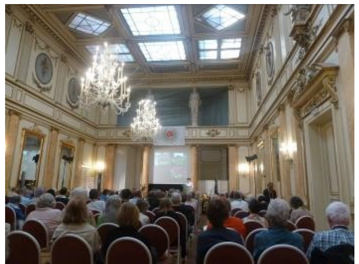
Left: Cercle Gaulois, Right: Lecture Hall