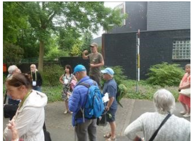
Left: Friendly faces from Japan (photo courtesy Melanie Trimper), Right: On tour trying to herd cats!