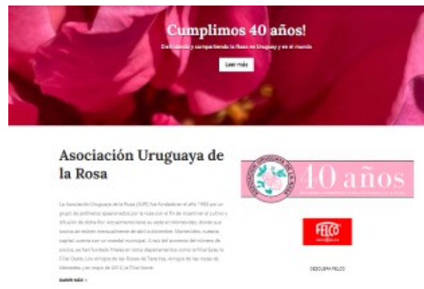
Left: Asociación Uruguaya de la Rosa Filial Oeste celebrates the end of 2022 activities, Right: Updated AUR Website