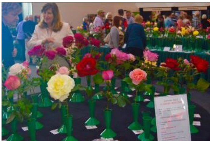
Left: Friends dinner, Right: Adelaide Rose Show